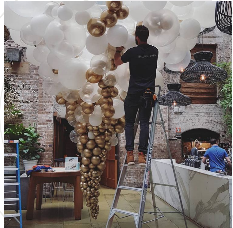
Air-filled, latex balloon decor

We can also provide flyers, posters and graphics to help you inform the public about the positive aspects of using latex balloons.